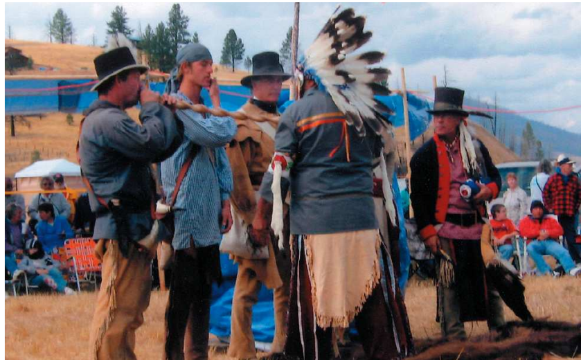
Smoking the peace pipe

Two hundred years and six days after Lewis and Clark had smoked the pipe of peace, we repeated this act. Two descendants of the original Corps of Discovery and several Salish descendants of the